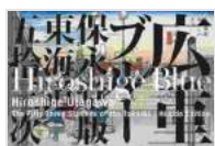
Hiroshige Blue (English Edition) / Hiroshige Utagawa The Fifty Three Stations of the Tokaido Hoeido edition: