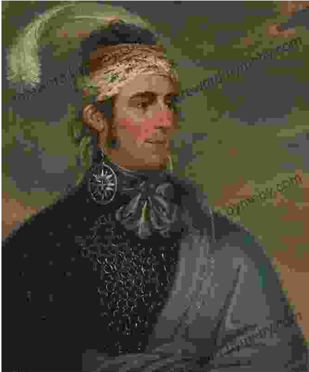
Image: John Norton, a Mohawk warrior who fought in the War of 1812