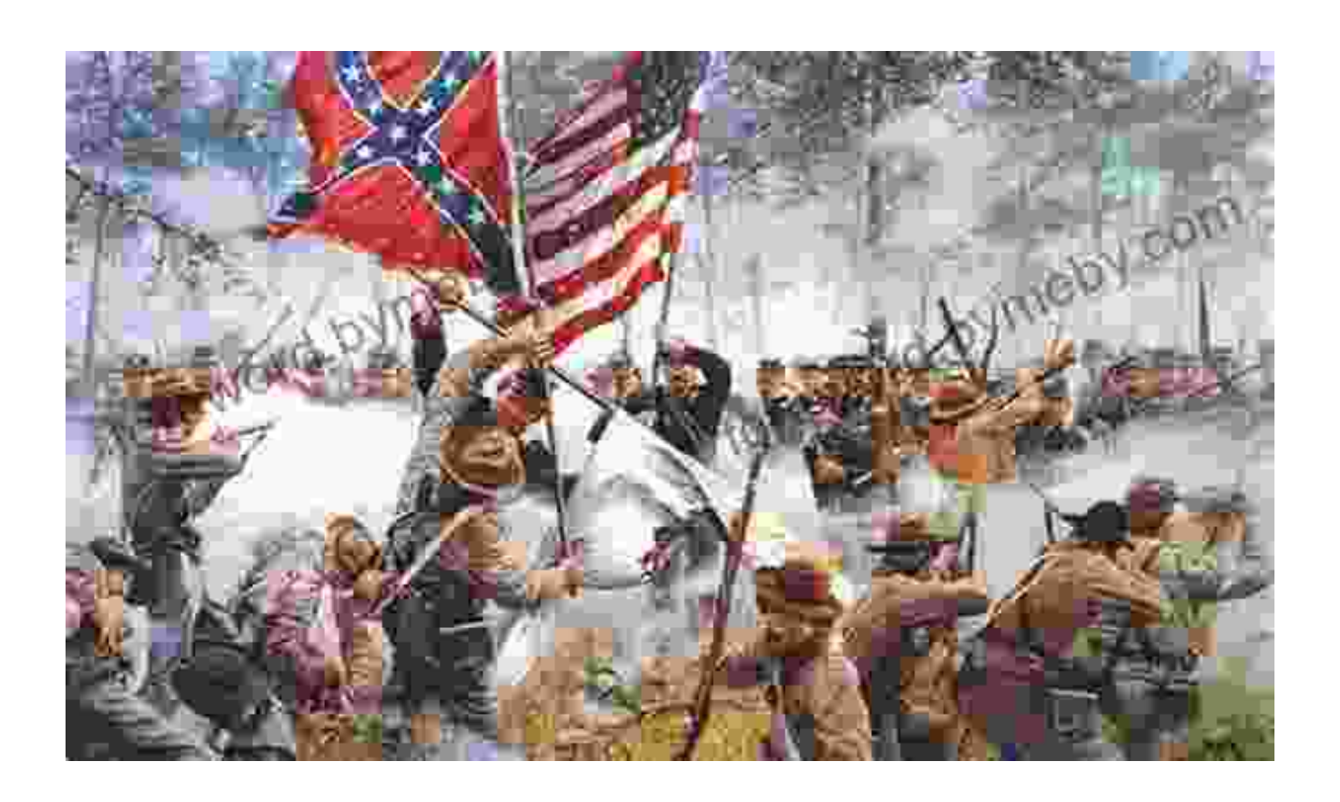
The Battle of Gettysburg, 1863

The Civil War was a watershed moment in American history. It ended slavery, preserved the Union, and paved the way for the development of a more just and equal society.