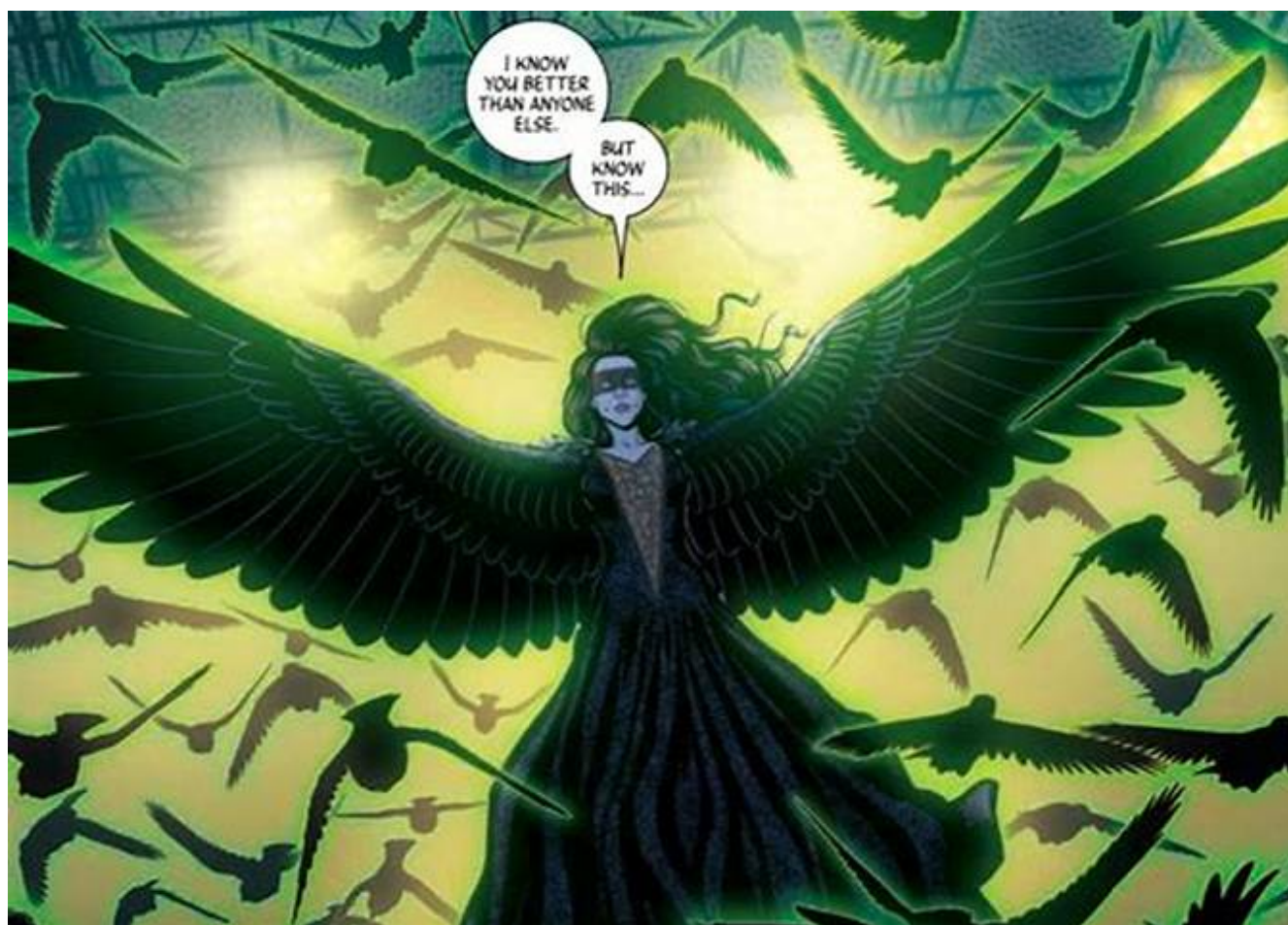
A Timeless Tale of Mortality and Divinity