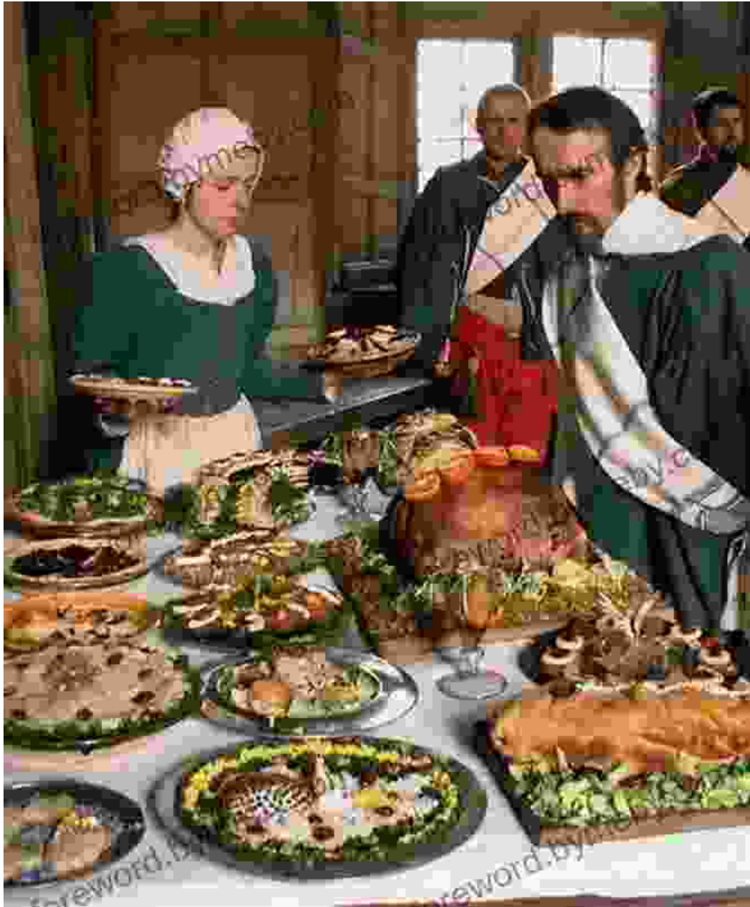
A medieval feast