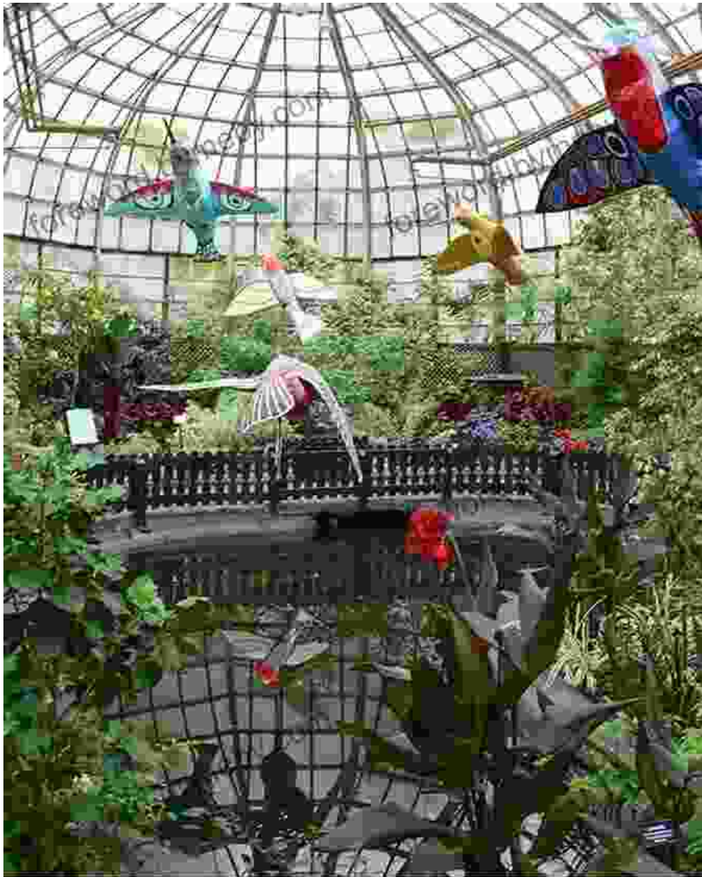
The Lincoln Park Conservatory, a vibrant sanctuary of exotic flora.

and flowers. John Doe's photographs capture the beauty of these natural oases, inviting you to stroll through lush gardens, admire towering trees, and bask in the tranquility of the serene lagoon. Whether you seek a quiet escape or a day filled with family-friendly adventures, Lincoln Park's natural wonders provide a welcome sanctuary.